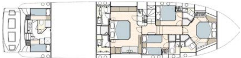
Lower Deck - Proposal A