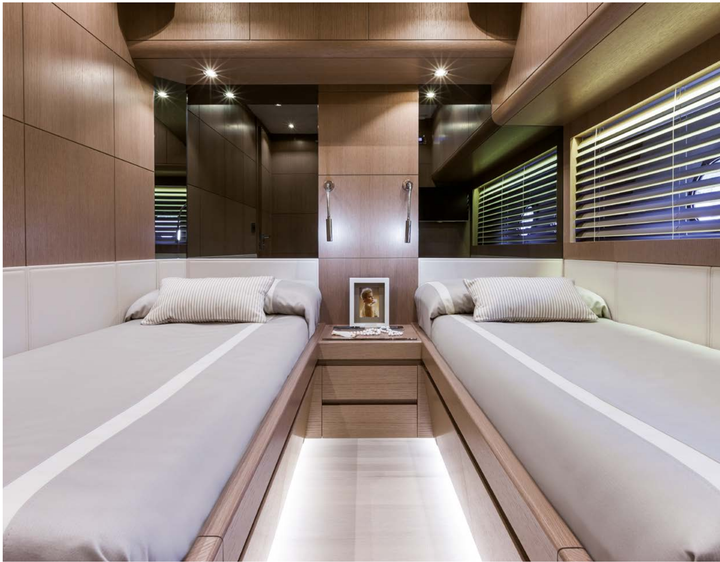
Portside guest cabin