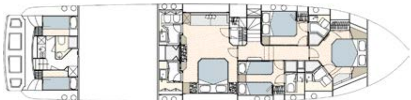
Lower Deck - Proposal B

© 2020 by Dominator Design & Development AG — All rights reserved.