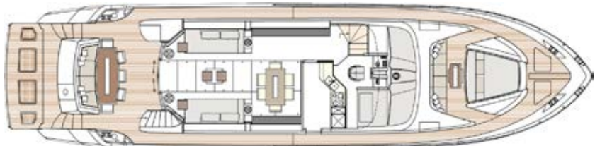
Main Deck - Proposal B