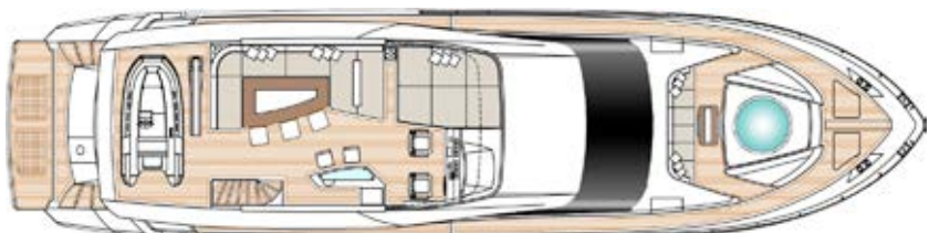
Flying Bridge - Proposal A

Engineering: Dominator Engineering Division