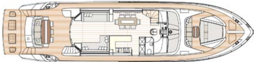
Main Deck - Proposal A