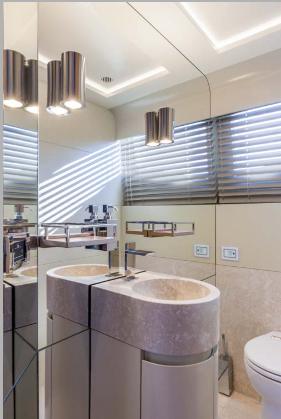
Day bathroom Starboard